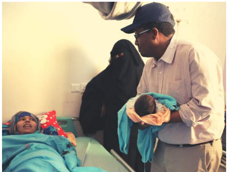
UNFPA Deputy Executive Director during a visit to the maternity unit at Al Thawra Hospital, Hodeida.