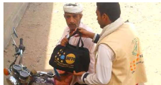
Distribution of RRM kits among displaced families in Al Hudaydah Governorate.