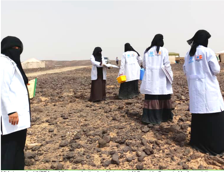
Midwives of a UNFPA mobile reproductive health team at AI Suwaida Camp in Marib, assisting displaced women and girls