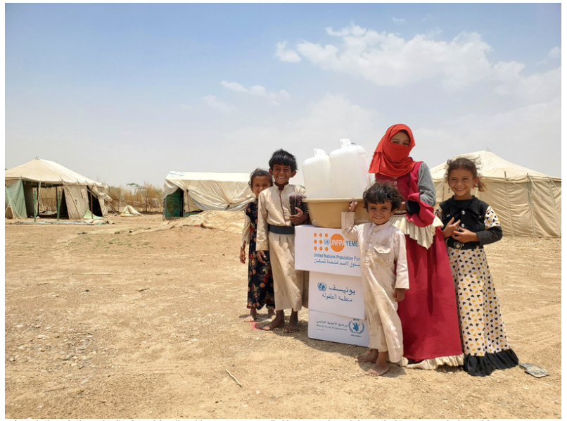
a female-headed newly displaced family with emergency relief items received through the UNFPA-led Rapid Response Mechanism at their temporary shelter in Al Jawf, Yemen