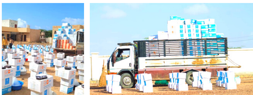
Distribution of rapid response kits in Al Jawf and Shabwah