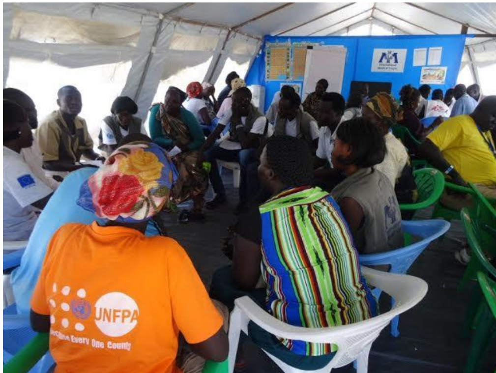
Health workers in Malakal are trained on how to mobilize community members to make use of Family Planning services.

The number of first ANC visits to the clinic has varied significantly from month to month, with an average of 250 patients per month. Taking the population of Mingkaman into consideration, this represents nearly 90% coverage, which is three times the national average.