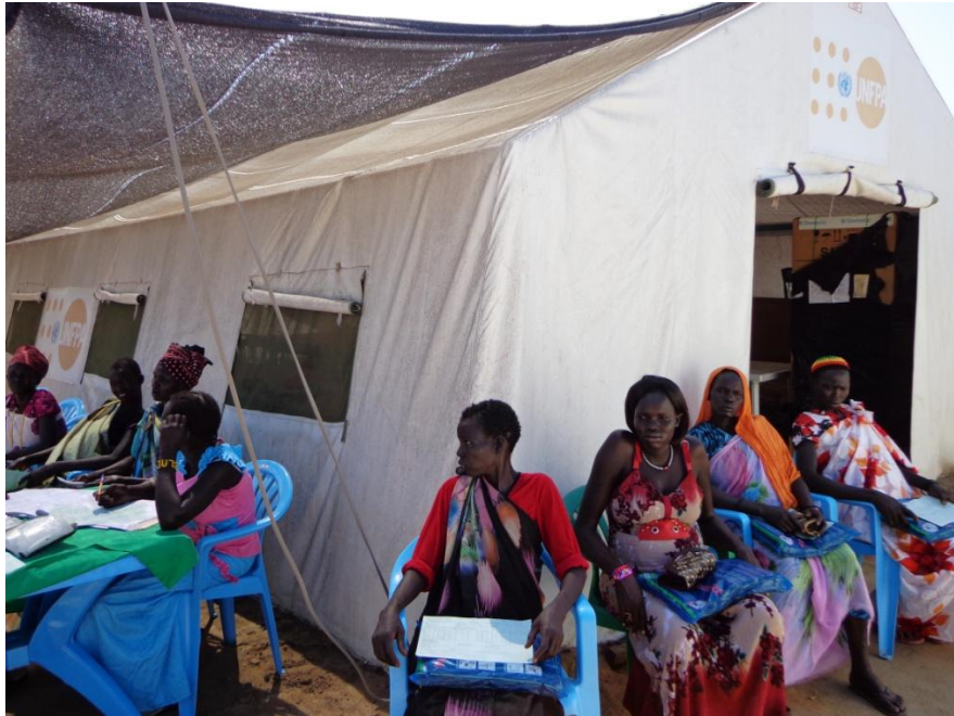
Pregnant women waiting for antenatal consultation at UNFPA supported RH clinic in Mingkaman IDP Camp