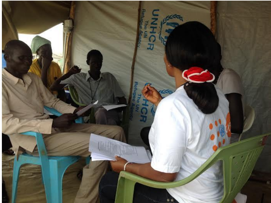
IUNV midwife in Bentiu trains community mobilizers how to engage beneficiaries in uptake of RH services