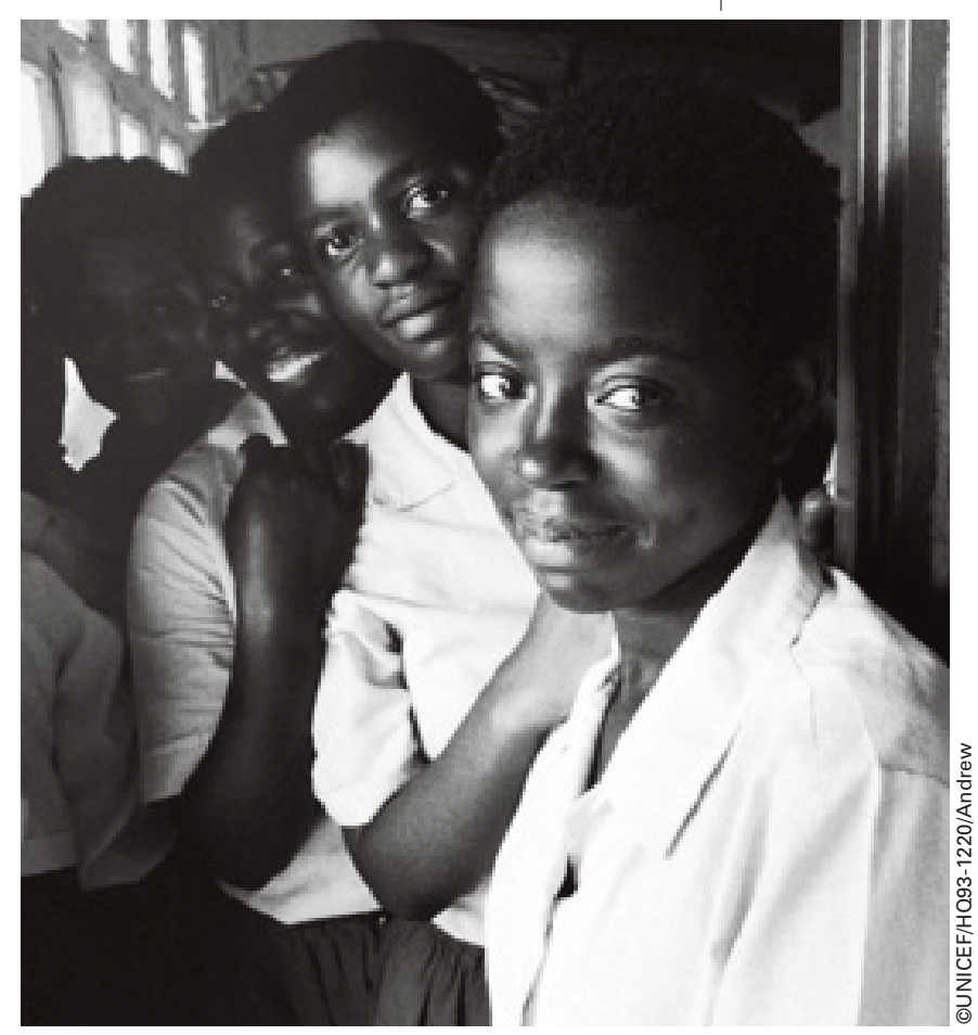
UNICEF, UNFPA and UNAIDS are working with the Malawi Department of Youth and local partners to improve education and adolescent health, provide vocational training and ensure greater participation by girls.

Over 700 girls took part in training on adolescent growth and development, values, self-esteem, good parenting, leadership and sexual and reproductive health, and dealing with the pressures of everyday life. A workshop was also conducted for 50 boys and 25 girls on gender sensitivity, equal rights and leadership.