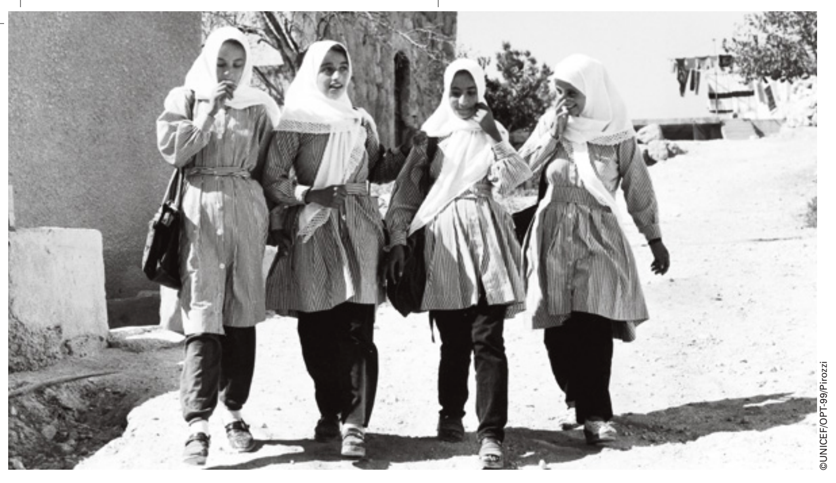
Girls on their way to school in Occupied Palestinian Territory.

"I FELT FOR THE FIRST TIME SOMEONE TRUSTED ME ENOUGH TO GIVE ME A RESPONSIBILITY. I FELT I WAS DOING SOMETHING GOOD, SOMETHING USEFUL FOR MY PEOPLE."