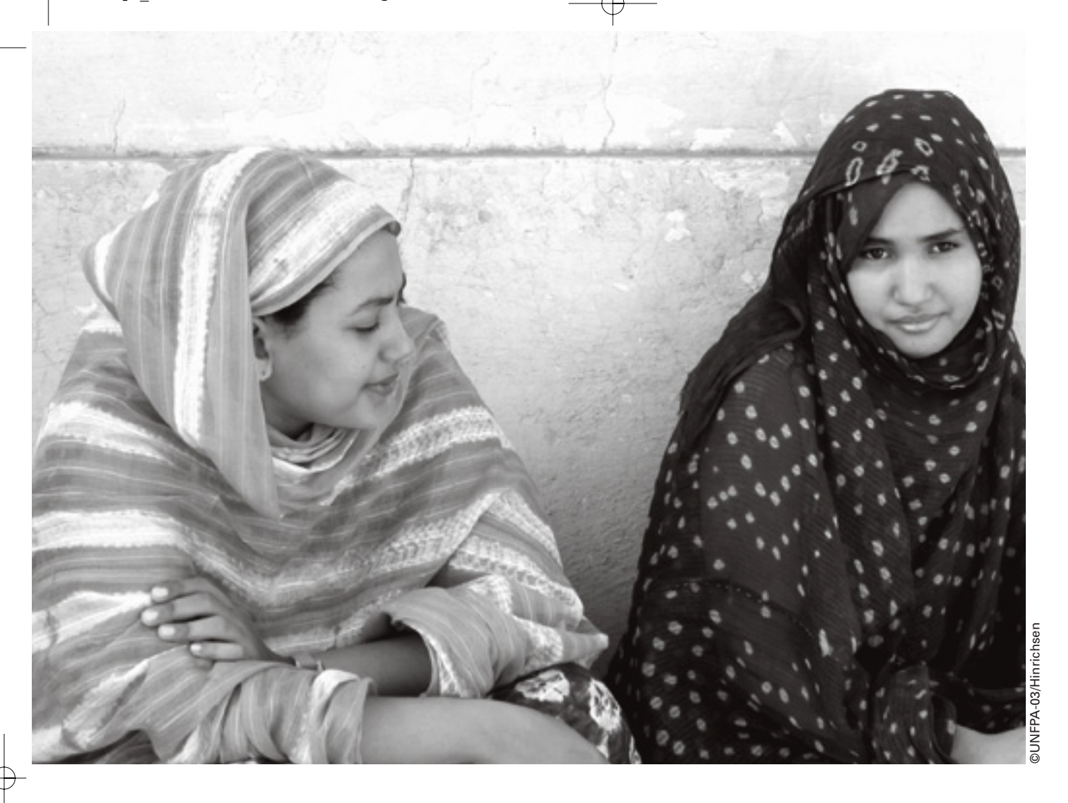
Educating girls is a priority in Mauritania. Here, two adolescent girls take a break from class in the town of Kaédi.

To provide a positive learning environment, WHO is collaborating with the village education committees in rehabilitating worn-out school buildings, streamlining water supply, reducing disparities and creating safe spaces and playgrounds, following the experience of UNICEF with its Clean, Healthy and Green Schools primary school programme.