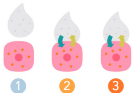
Iso-osmolality: happy cells