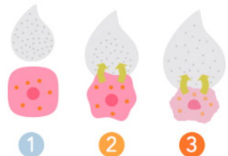
Hyper-osmolality: dried out, shrunken cells