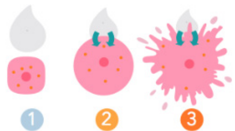
Hypo-osmolality: swollen, ruptured cells