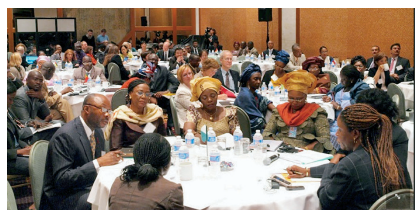
Participants at the UN High Level Meeting on Reproductive Health Commodity Security.