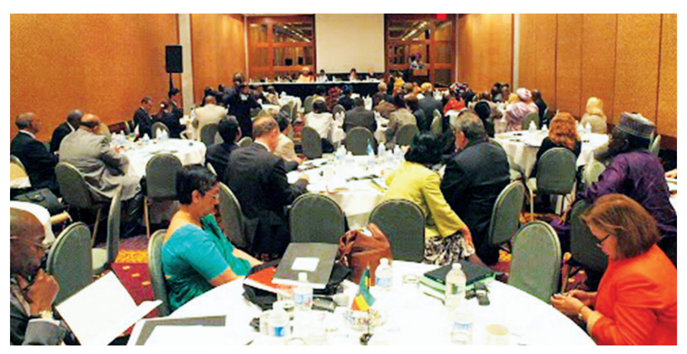
High-level officials hold a panel discussion on the theme of scaling-up maternal mortality reduction efforts through reducing unmet need for family planning