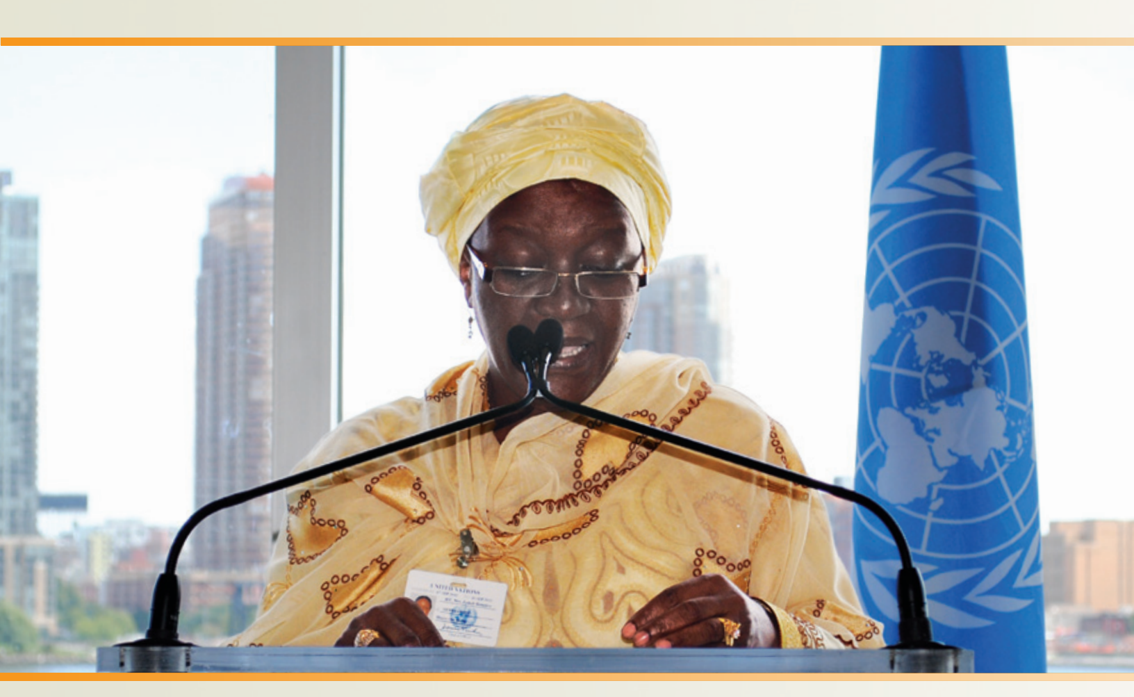
New York, New York — 7 and 8 September 2011