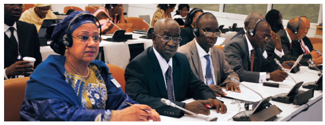
Honourable Ministers and Parliamentarians in the ECOSOC Room, UN Secretariat, developing the Call to Action.

The drafting and review of a Call to Action was prepared at the end of Day One by honorable members of Parliament from participating countries. Finalization and adoption of the Declaration took place on the morning of Day Two in the ECOSOC Room of the UN Secretariat Building, notwithstanding a temporary power outage. In the end, 50 participants from 12 developing countries agreed on a Call to Action that urges national governments, civil society and the private sector to provide stronger leadership in reproductive health commodity security. To achieve that, participants urged these governments and national stakeholders to reinforce existing political and financial commitments for reproductive health commodity security, invest in stronger supply chain management systems for reproductive health commodities, and ensure expanded and equitable access to services.